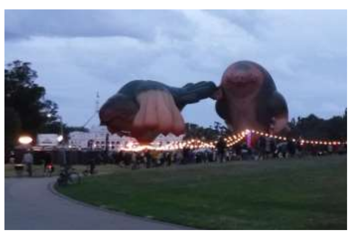
Skywhale and Skywhale papa getting ready for takeoff on the Old Parliament Lawn.

We got to the Old Parliament House jetty just before dawn, hurried up the lawn to be treated by a beautiful, albeit weird, vista of Skywhale and Skywhalepapa getting ready for take-off.