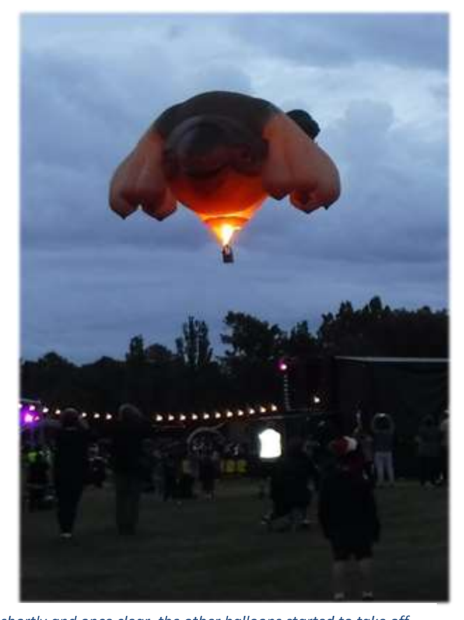
Skywhale papa took off first to explore the skies. Skywhale followed shortly and once clear, the other balloons started to take off from the National Library Lawn