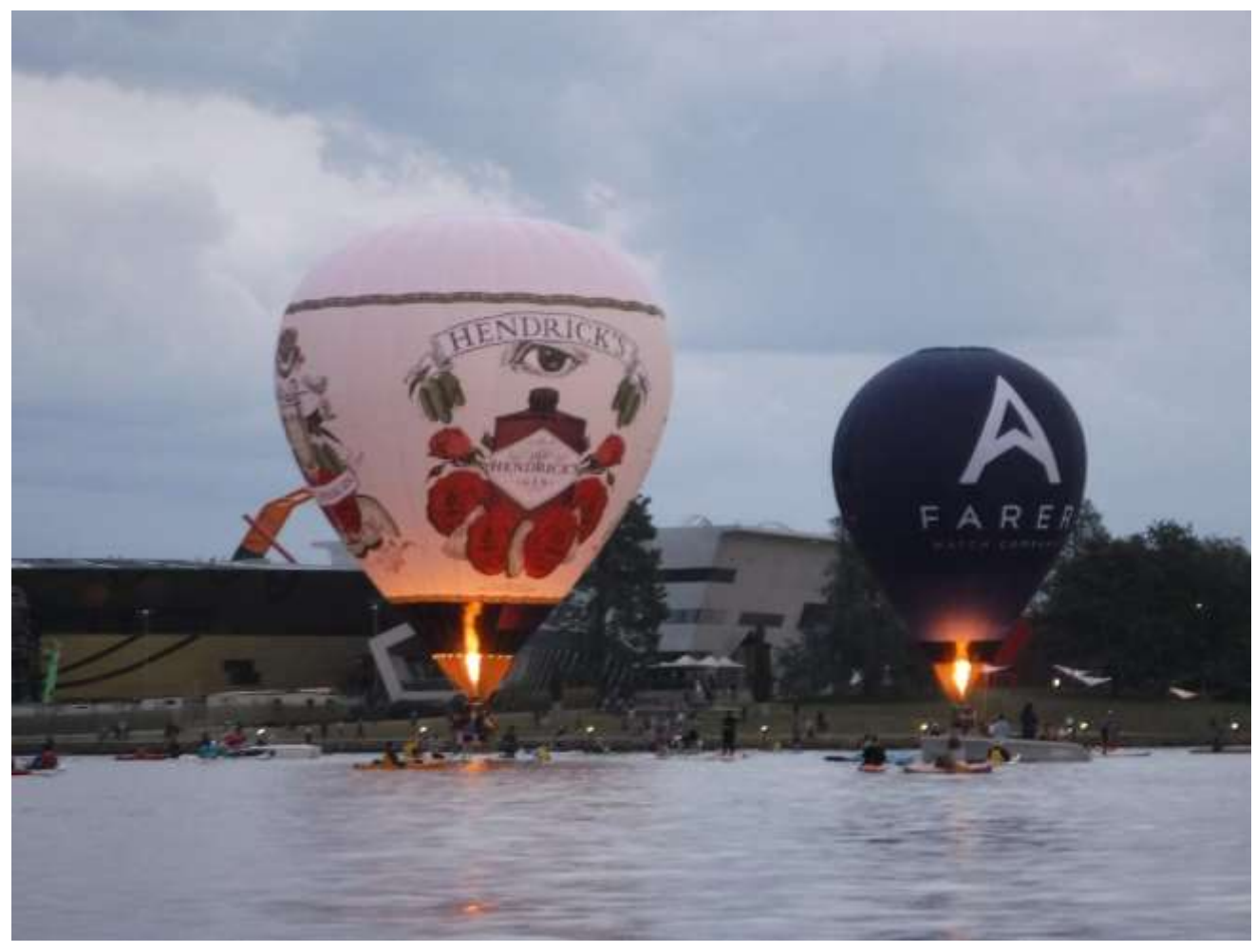
The Hendrick' Gin balloon taking a rather deep dip in the lake!

Unfortunately, the atmosphere was not stratified and the wind direction was westerly through the deep surface layer so the balloons drifted off towards the Arboretum, not to be seen again! We turned tail and paddled back to the shed, after a coffee and a yarn.