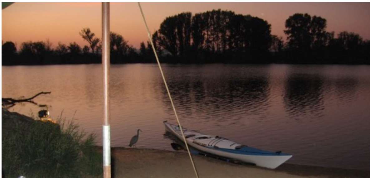
Early morning tranquility, Molonglo Reach, 26 November 2006

Enter As: Solo; Team of maximum 4x boats (competitive); or any number of boats (fun)