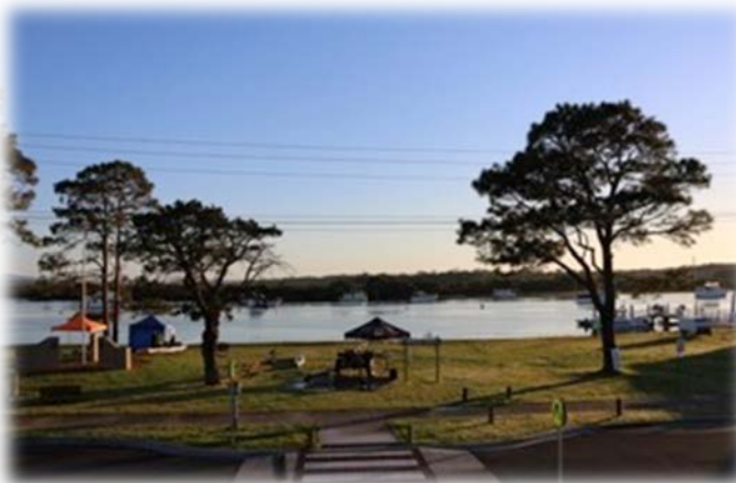
The foreshore at Tea Gardens

Distances offered are 12 km, 27 km and 47 km, the longer course being a perfect shakedown for the Hawkesbury Canoe Classic held in late October."