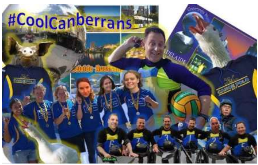
Our very professionally executed Facebook poster

If you like Canoe Polo, (or doggos), check out our Facebook page: <a href="https://www.facebook.com/ACTCanoePolo/">https://www.facebook.com/ACTCanoePolo/</a>