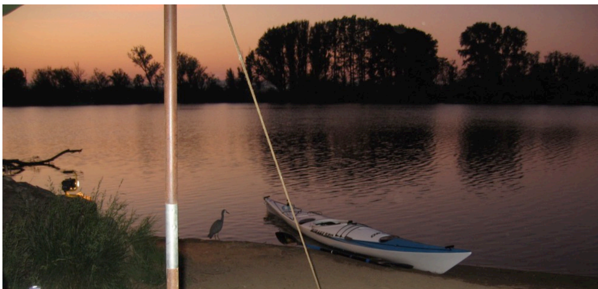
Early morning tranquillity, Molonglo Reach, 26 November 2006

Finish Time: 9:30 a.m., Sunday 10 December 2017