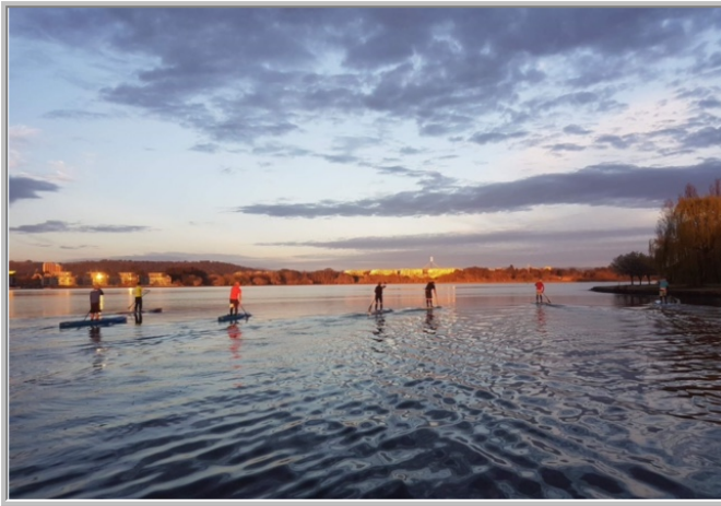
Group morning training session on calm waters in the main basin

Rohan Evan, 2nd place O40s Mens — The Chucky, Fishermans Beach 8km — Ocean Race