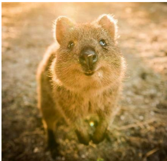
Left: WA's favourite marsupial, the Quokka. Very appealing!

Looking for your next challenge, or to add something to your bucket list? The annual Avon Descent finishing in Perth may be to your liking. I am from Perth, having moved to Canberra mid-2016 for work, and suggest the two-day event.