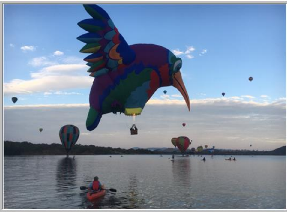
Canberra Balloon Festival