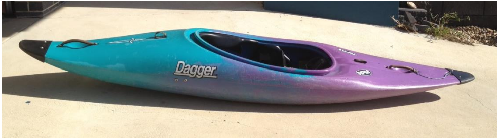
Kaituna $500 or ono