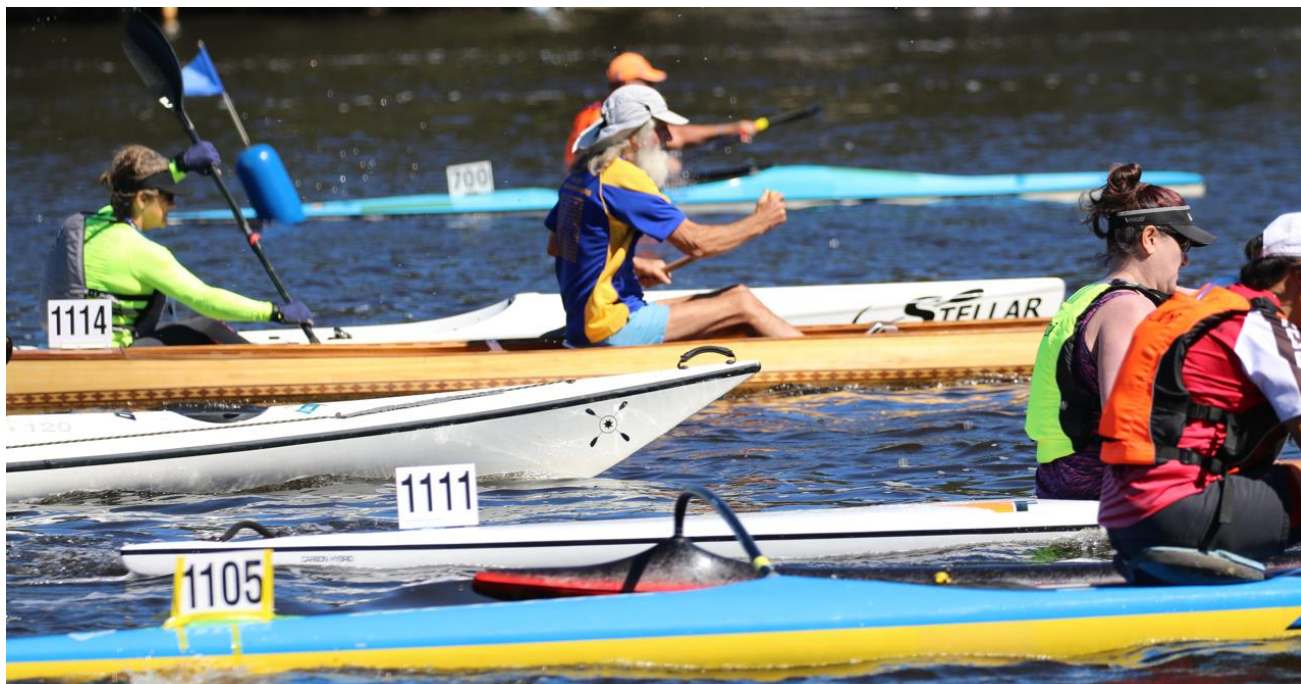
Above: The start of Division 11, with the usual mix of skis, sea kayaks, K1s, outriggers and canoes.

Injury and other commitments reduced the number of South Coast paddlers at the Wyong Marathon Series Race.