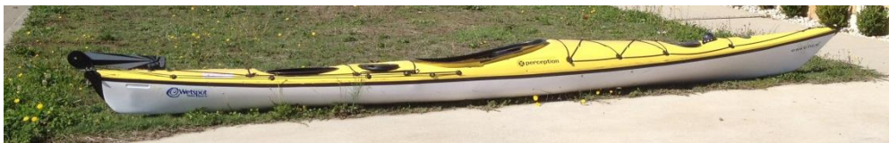
Sea Kayak $1200 or ono (set up for the Hawkesbury and has done it)