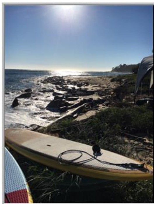
Photos from Come and Try Surf SUP day at Moruya