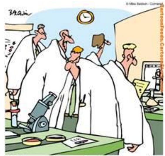
While experts remain at odds over the issue of when life begins, most agree it's sometime after work.

Question: What does every paddling Dad REALLY want for Father's Day? The Answer of course is a: "Hand-crafted authenticlooking scale-model Epic V7 Mud-Chocolate Kayak Cake"!!!