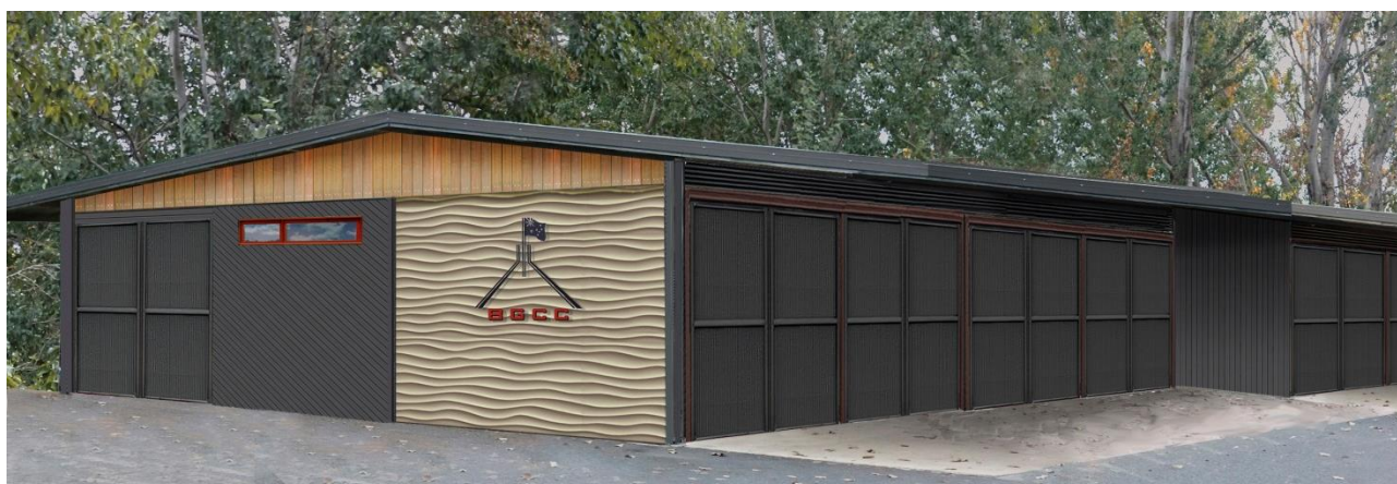
Western (Civic) end of Club Shed with "Weathertex"

As members would recall from previous reports, one major cause of delay has been in the preparation of external design plans that are acceptable by the National Capital Authority (NCA). Objections have been raised over the use of colourbond and the external colours used. As a result of Robert Bruce's work, we are closer to having our design acceptable to the NCA. The new designs incorporate weathertex for external cladding rather than colourbond , and we are hopeful that this will not add too much to construction costs. Two examples of the designs are shown here