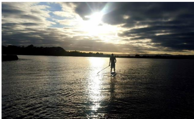
Dawn on Lake Burley Griffin