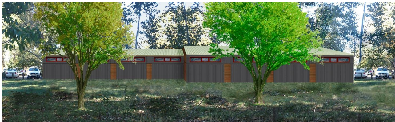
View from Morshead Drive: North Face/Rear of Club Shed with Grey Panels – Stage 2

Two other matters which have been occupying the sub-committee over the last month have been the removal of the toilets in the section of the shed now occupied by the Ice Dragons and the TAMS plans for replanting trees once the five marked for removal are taken down. The toilets have gone, and TAMS have shown us what they intend to plant, along the lines of what appears in the draft design of the north face of the shed, closest to Morshead Drive (see below). Whether the new trees will be planted before work is completed on the shed extension remains to be seen.