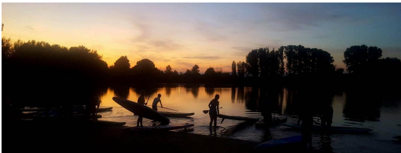
Setting out at dawn at Molonglo Reach