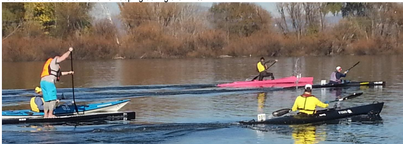
Beautiful conditions for Sunday’s time trials and NTTS at Molonglo Reach.

Note that local time trials are not held on weekends that coincide with PNSW marathon races. The calendar for the remainder of the winter is below, with NTTS events marked as well. Big thanks to those of you who have volunteered to assist with time keeping during the winter.