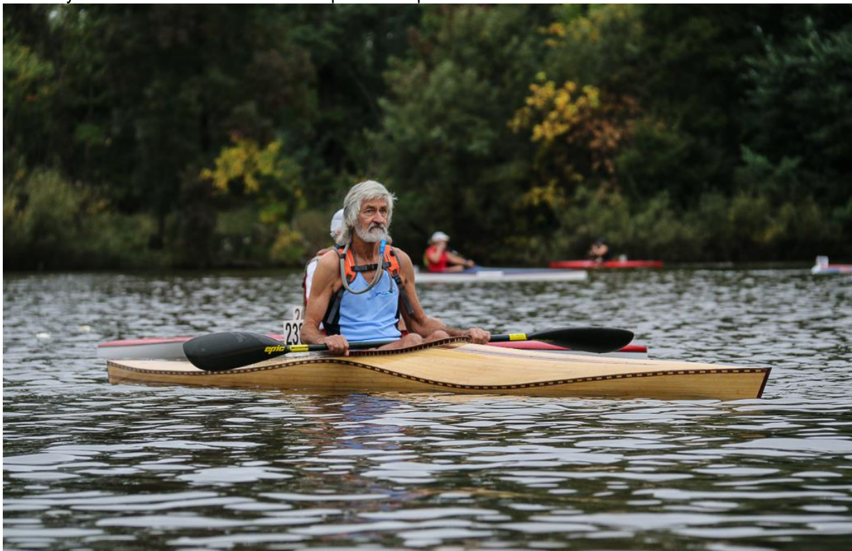
Above: the prize-winning photo