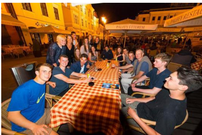
The team enjoying a night out in the central square of Győr.