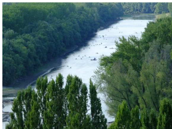
View up the course at Győr. Afternoon training session with the U12 paddlers!

So I went and I was conquered – out-paddled by a Spaniard, a Dane and a South Africa. They dropped me within a kilometre and so the dye was cast, a goal was set ... win a World Masters Cup K1 title. The task ahead of me was not trivial. As a sprinter, I had a lot to learn about pack racing and portages and wash riding and being assertive but not aggressive. The women who were faster than me in Rome are very good paddlers and I knew that beating them would take careful planning and probably a couple a years. A quick analysis of results and looking at the way masters race internationally, it appeared that Győr, Hungary would be the year to aim for. Not only would I have the advantage of age (being the youngest in my age group) but there would be an added satisfaction of winning in Hungary where kayaking is the national sport.