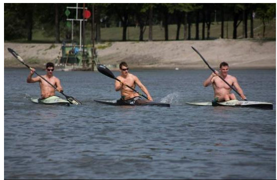
Enjoying the warmth on the course in the lead up to the Worlds.

More analysis and on paper, I was still not fast enough if I was going to win against the Europeans in Hungary in 2015. To reach my goal, I made two major changes to my training program. Firstly I did not take a 6 week break on returning to Australia after Oklahoma. Instead I immediately went back into cross-training, in part because I had to get fit for a research trip to Macquarie Island. I also spent a lot of time working on technique and I upped the hours spent running and in the gym. This meant that by January 2015, I was significantly fitter and stronger than in previous years and my technique was more reliable.