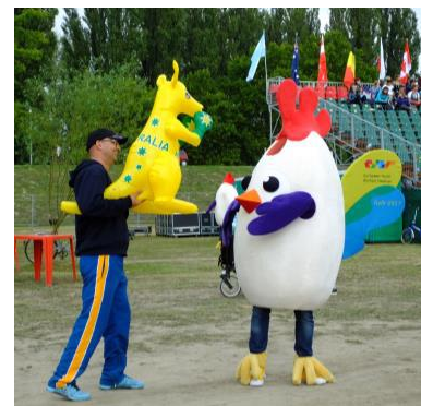
Kangaroo meets Chicken! Unfortunately the Chicken won!

I did three things that I think played a huge part in my later success in Hungary. First I tested myself to determine how much I had lost during the 4 week away from training. I did this for all aspects of the race – how fast was my start; what was my time over one lap; how fast could I run the portage; how fast was I in and out of the boat; how strong was I. Second I compared these data with those from the South African National Championships and from my training diary to determine which aspects had suffered the most. Finally, I developed a training program that addressed those aspects in which I had lost the most performance whilst maintaining and slowly improving the remaining key aspects of the race.