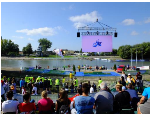
Race Day. View from the spectator stands