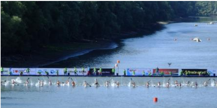
Start of the Men K1 race at Győr.