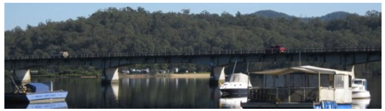
Our usual paddlers are all aware of the protocols we have in place for running our club events and are expected to follow them.

New paddlers or non-club members will not be able to take part in a sanctioned club race unless club members in attendance appoint a paddle coordinator and follow our usual protocols - ie, conduct a briefing, appoint a timekeeper, organise PNSW insurance, require inexperienced paddlers to wear life jackets and so on. If this can't be done due to lack of available club members or knowledge of what needs to be done and those in attendance still wish to proceed with a paddle, a club member must decide to and announce the cancellation of the club sanctioned event and those participating in any paddling activity that takes place are responsible for themselves.