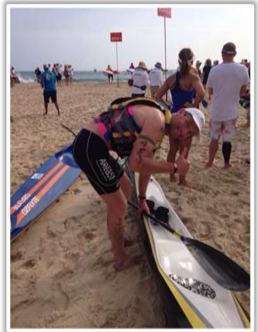
I was not smiling like this 5 hours later...