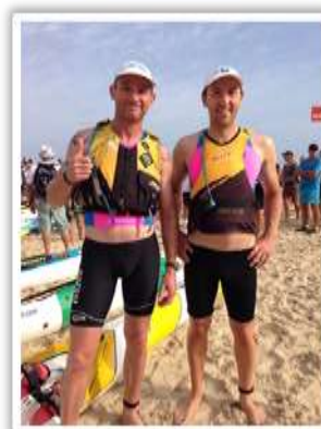
Oh yeah! We've got this nailed! May as well hand over the finishers' medallions now...