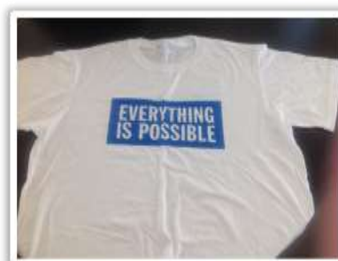
Some inspiring support sent from the boys at Menslink.

Some of you may have noticed us out on the river paddling our mals in the kneeling position. This is really tough. Balance is hard & the workout for your butt muscles is intense! We did a couple of time trials as 'surf multicraft' with 2 laps on ski & 1 lap on mal. We also did a few brick session (combining multiple disciplines) down the coast. I went up to Manly in early September & did a test event over half the Coolie distance – that was a horrible failure...my ski paddling in the ocean swell was abysmal. I was really praying for flat conditions for the big race!