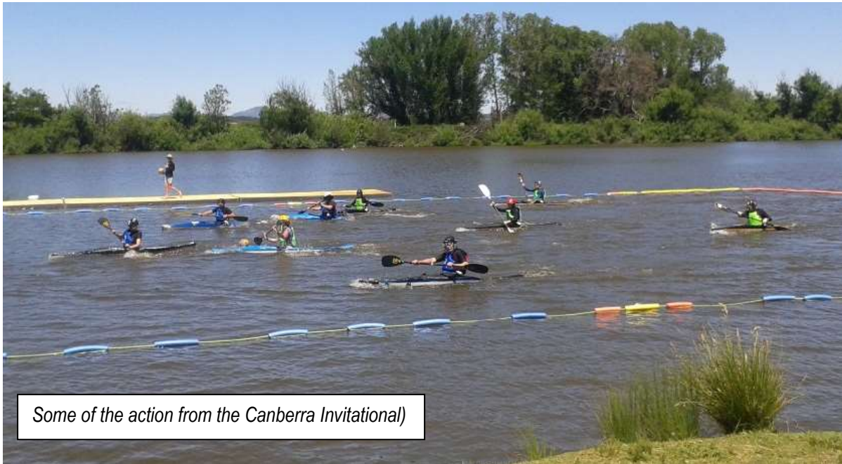
Some of the action from the Canberra Invitational)

This month, the club hosted the first event of the 2014/15 Australian Canoe Polo Summer Series, the Canberra Invitational, on November 1 & 2. Two A grade, Two B Grade and Two Juniors Teams were fielded by the club. We're pleased to announce that the Burley Babes (BGCC) won the B grade competition and the Dream Team (BGCC) placed third. In the A grade competition, PSV (BGCC) made it through to the Grand Final against The Inbetweeners (SA) and, although the South Australians proved too strong for PSV, we are elated with Second place honours. Kanusport, another BGCC A grade team, tied for Fifth position.