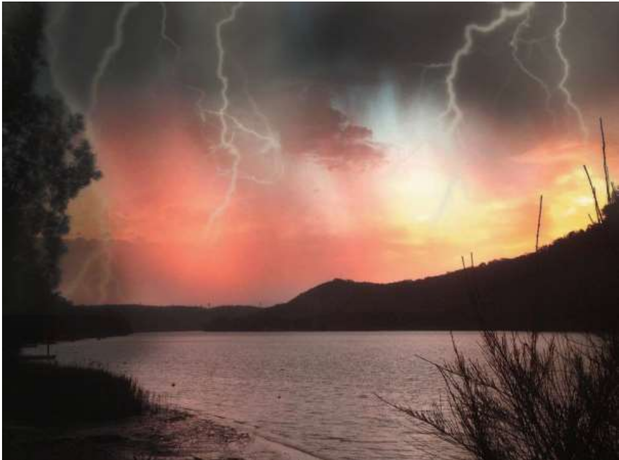
taken at Wiseman's Ferry