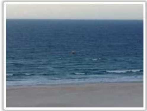
The conditions don't look too bad...until you appreciate the scale of this picture. That buoy is 100m off shore. And somewhere in the middle of the shot is a lone ski paddler hidden among the swell..

I exited the swim, said a cheery g'day to my support crew & the officials on the beach & headed in to transition to grab my mal. That's when disaster struck.