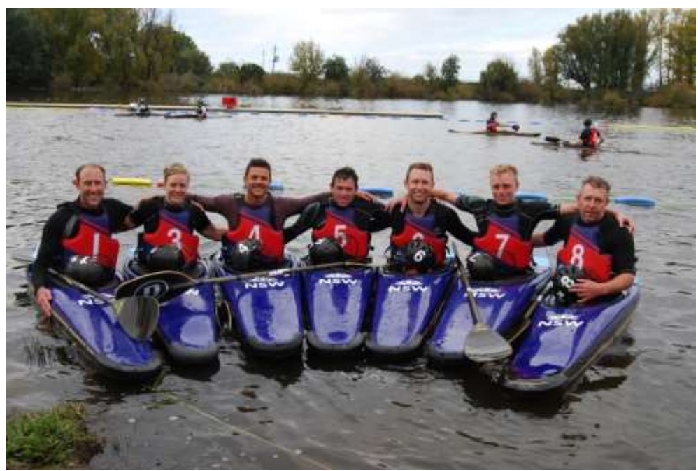
2014 Australian Canoe Polo Open Division Champions – NSW Open 1

Division Grand Final, with the 'Mixed Masters' composite team, comprised of players from different states/territories, taking out 3<sup>rd</sup> place.