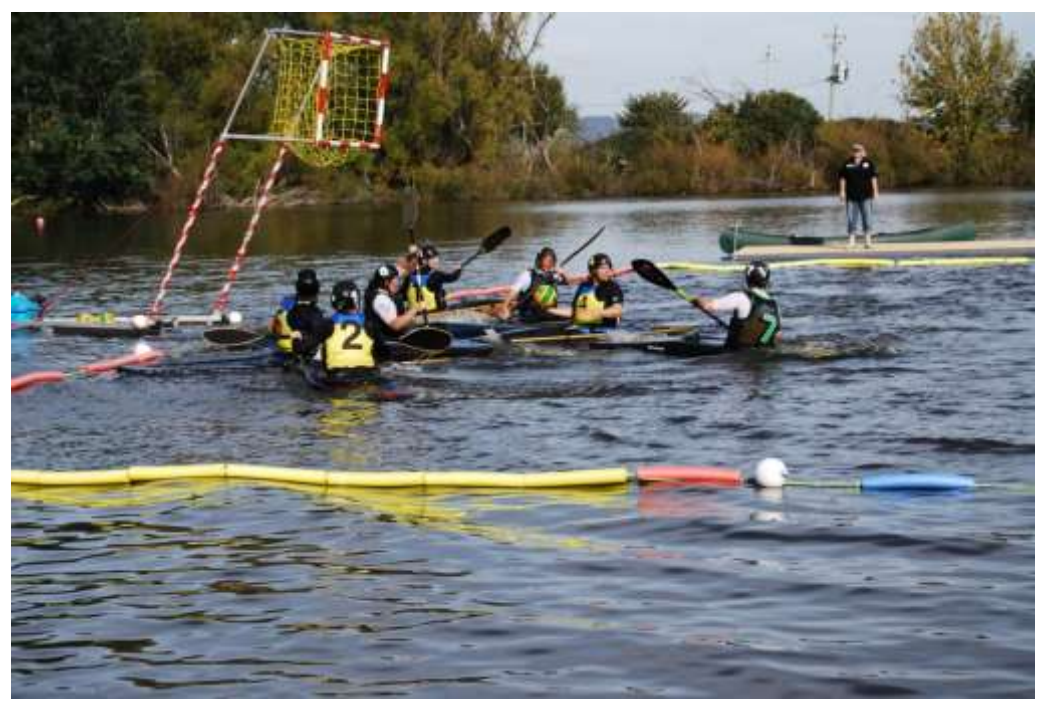
The ACT Women regain posession of the ball after thwarting another Victorian attack.