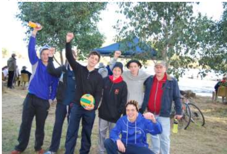
The Queensland Juniors after winning Bronze in their division.

teams to the National Championships in the coming years. The Youth division Grand Final saw Victoria triumph over South Australia in another fantastic match of Canoe Polo.