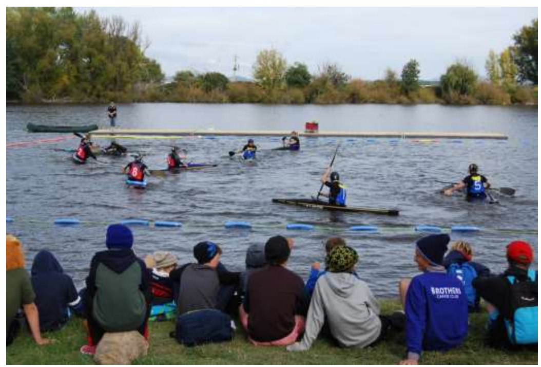
Juniors look on as the ACT Veteran's become National Champions.

The 2014 Australian Canoe Polo National Championships were a great success. Although the competition days began with chilly and foggy mornings, the sun emerged and shone upon the competition throughout the weekend. The relatively warm weather motivated some tremendous displays of athleticism during the championships.