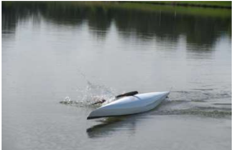
Next: A look at the beautiful white hull

I am sure he is looking to see who pushed him!