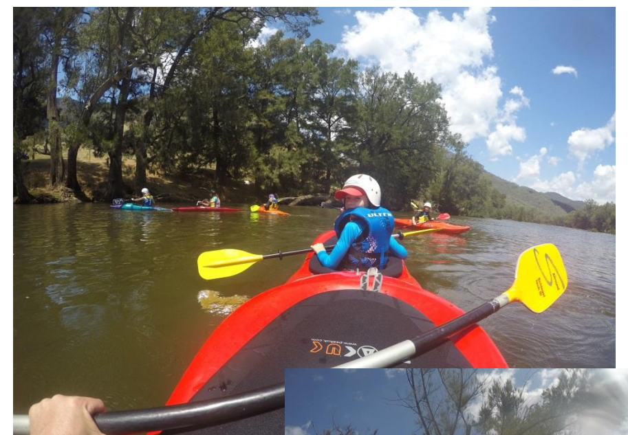
Left: Looking upstream from just above the slalom rapid

Right: Looking upstream from the bottom of the slalom rapid. Everyone is still dry!