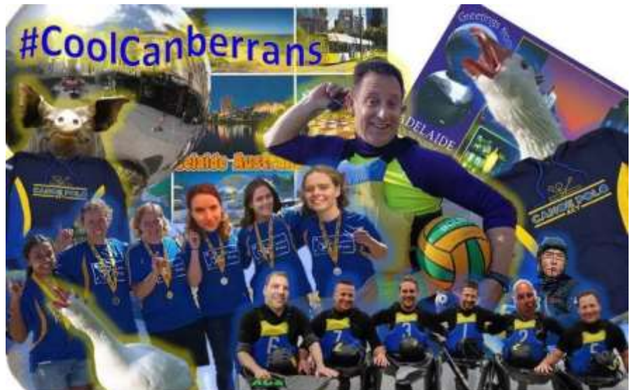
Our very professionally executed Facebook poster