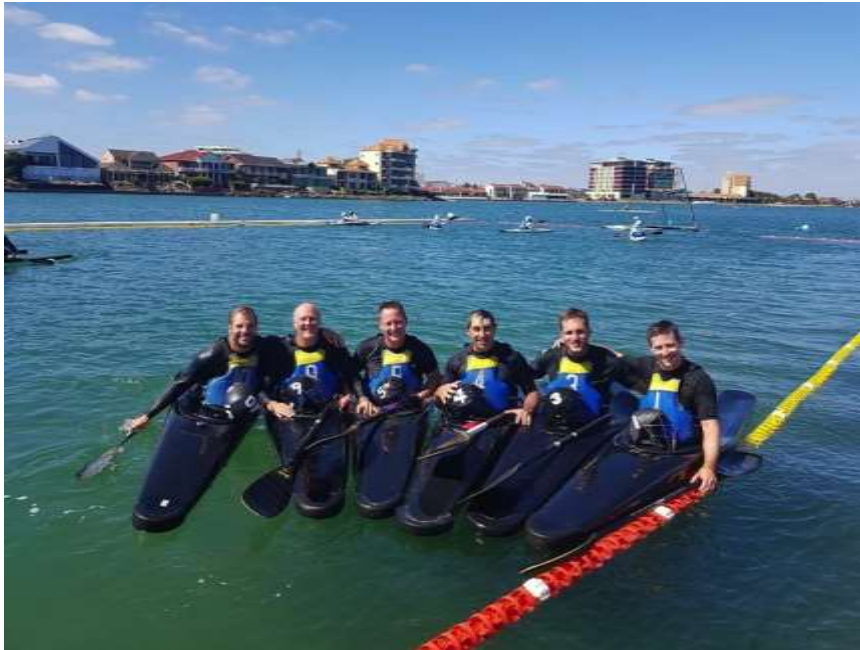
The less victorious Open's team