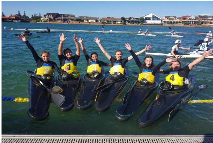
The victorious women's team

Described as having "shed their 'flabby and fifty plus' reputation" and "ready to show their younger opponents the wisdom seventy years in the APS can bestow on a man", our Open Men looked on form over the weekend, making it to the 3rd/4th playoffs against Vic 1 (a very stressful game for spectators) but the lads unfortunately went down in the match and out of the medal rankings.