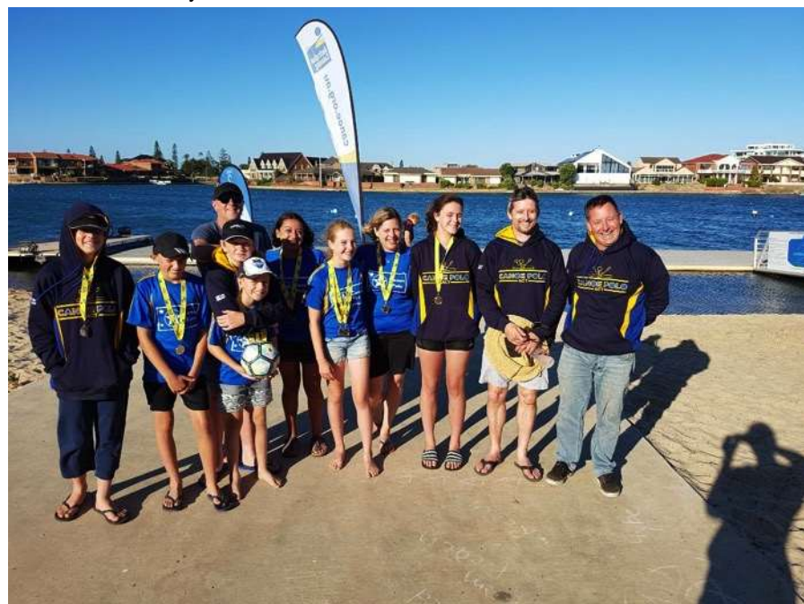
Some of Team ACT with their medals