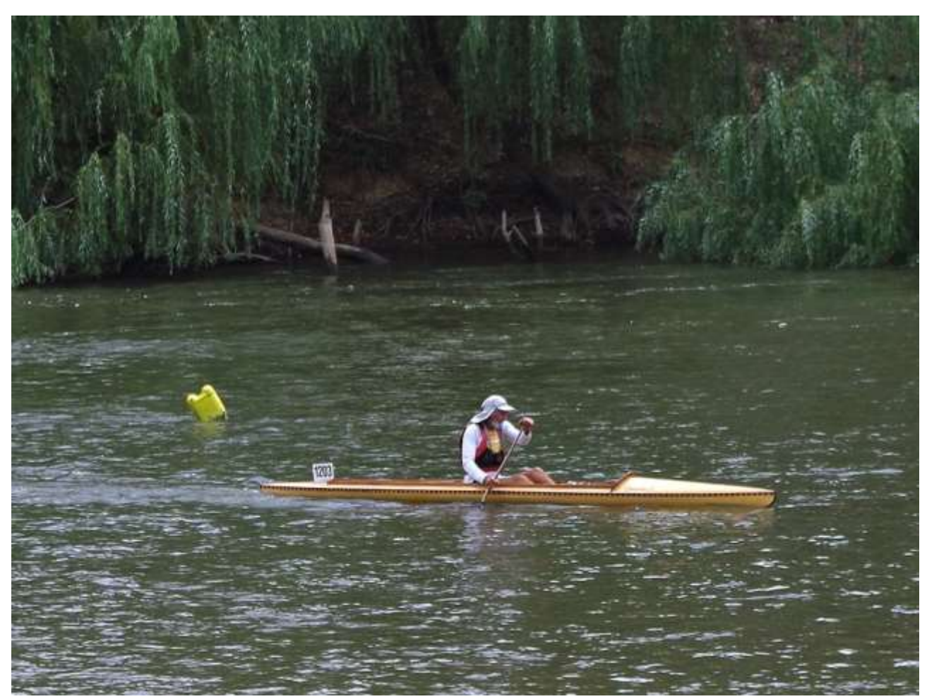
Keeping the bottom turn tight reduces the time lost battling back upstream to the finish

Until I went down to paddle the Frank Harrison Memorial Race on the Murray, I had little experience in the C1 in fast flowing swirling water. However my experience there convinced me that unless the Murrumbidgee was very high or very low, I should be able to manage at Wagga.