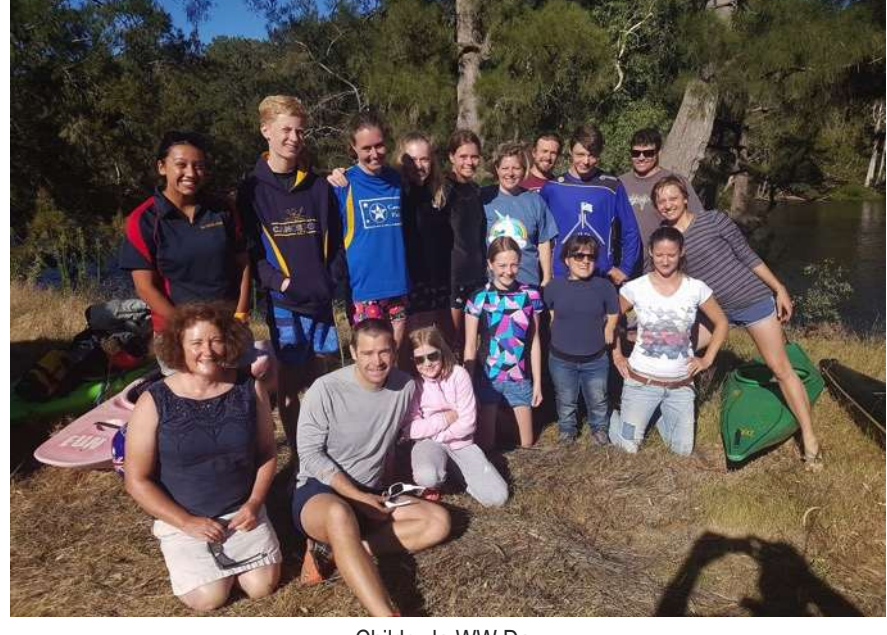
Childowla WW Day