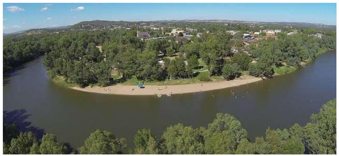
The Beautiful 'Bidgee Town Beach: the Start/Finish line at the blue tent, turn buoys to the right, Green Buoy to the left.