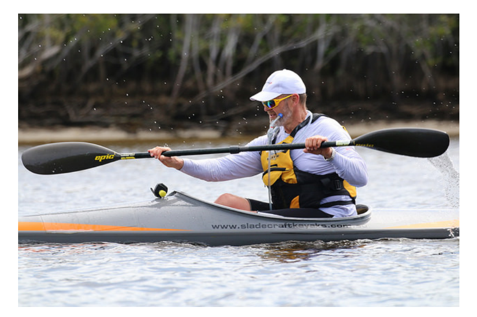
Richard Fox

The event was very well attended and seems to be growing in popularity. Perhaps