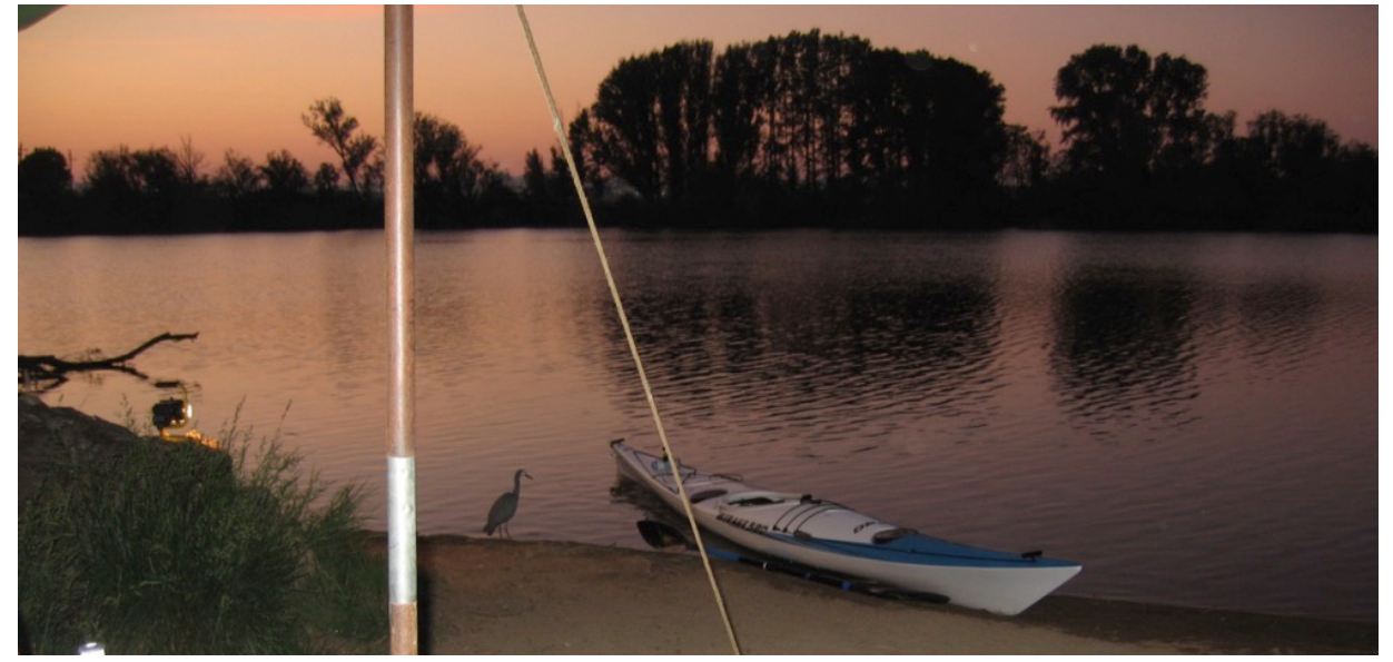
Early morning tranquillity, Molonglo Reach, 26 November 2006

Paddler Safety: There will be a safety boat stationed at the start/finish area, but paddler safety is to be by paddlers caring for anyone in need of assistance on or in the water. Paddlers are all to have at all times out on the water: a pea-less whistle, readily available to relay a message along the river that the safety boat is needed – either upstream or downstream of the start. Any time spent in assisting another paddler in difficulties will be allowed for in the distance paddled.