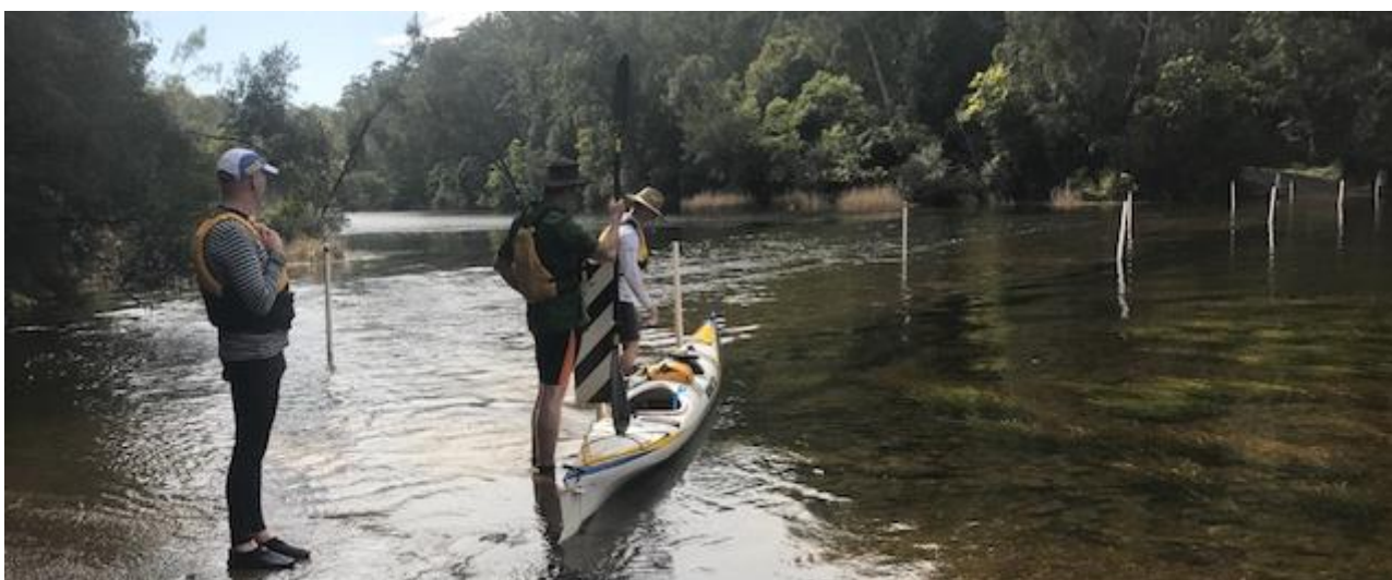
Above: Paddlers training for the Hawkesbury Canoe Classic: the club Mirage 730 at Shallow Crossing

Could you let me know what sort of time frame you are looking at, what boat you are using, i.e. double or single; if you require it transported and which check points you are considering stopping at.