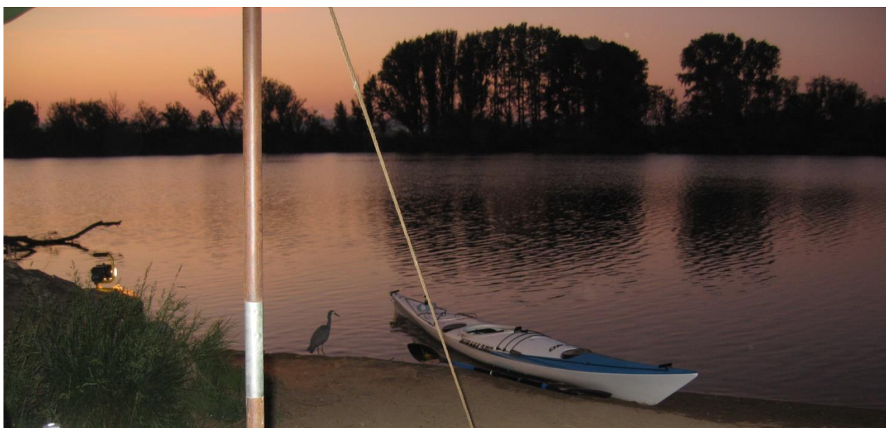
Early Morning Tranquillity, Molonglo Reach, 26 th November, 2006.

Finish Time: 9:30 a.m., Sunday 10 th December, 2017