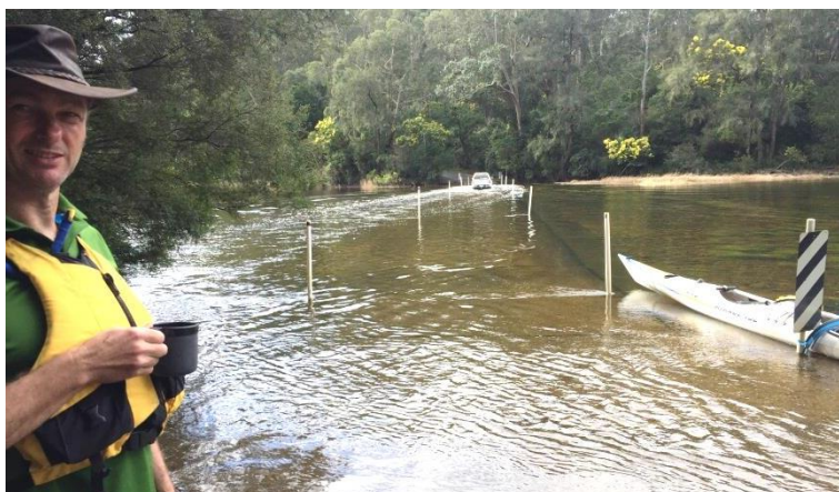
Above: Pete enjoying a Cuppa-break at Shallow Crossing

The four of us (Graeme, Shane, Denby; and Pete Connolly) set off from the boat ramp at about 09:30, in glorious weather and with a good incoming tide to assist. Pete and I had arrived in Bateman's Bay the night before, so had a leisurely morning and breakfast at the River Cafe next to the launch point. The people at the café were kind enough to give us tea bags for our half-way brew. We all met up at the mid-way point and had a nice cup of tea and a tin of tuna, ahead of a following/outgoing tide to take us home. The quality of water in the Clyde River compared to LBG and the absence of speed boats made for one of the most enjoyable paddles we've had in a long time. Our total paddling time was 5 hr 12 min over the 45.92 km.