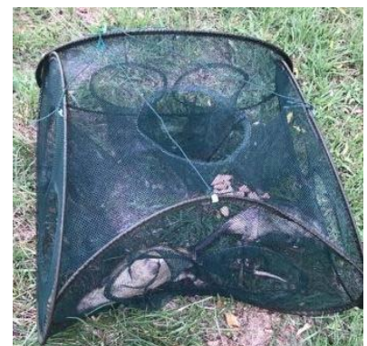
Above: 2 Water Rats, drowned in LBG