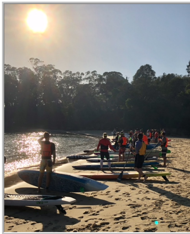
Balmoral SUP X race line up