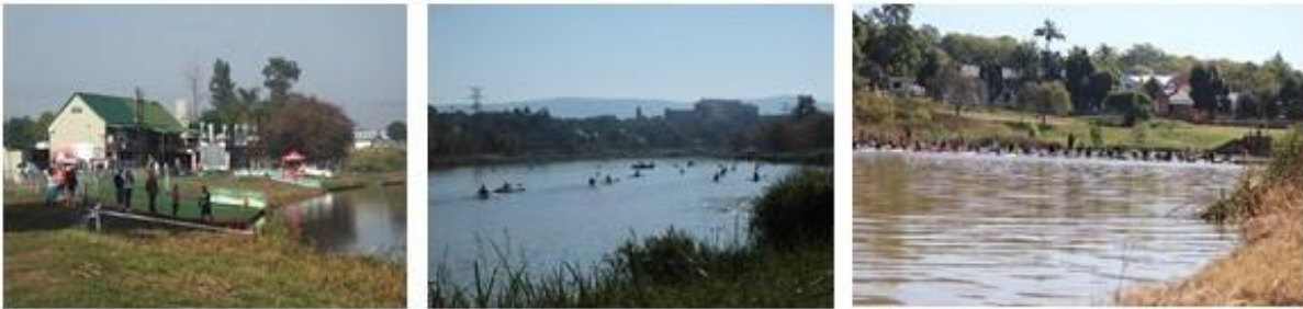
Camps Drift venue. Portage and clubhouse, looking up the course, U18 MK1 start

The course that we raced on will be the same course for the 2017 World Championships. The South Africans are working hard towards making 2017 successful, not only in terms of the event and its management, but also in terms of winning as many of the races as possible. There is a very high energy vibe about marathon canoeing in the country at the moment. The course itself is not unlike the Molonglo, a narrow semi-flowing river but they have good visibility of much of the course and an excellent boatshed arrangement as shown in the photos here.