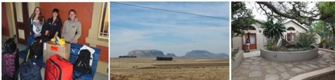
Travelling light! First glimpses of South Africa; Wenleydale Lodge

We arrived in Pietermaritzburg just after lunch so were able to sort out our accommodation, visit the course, check up on our boats and visit the supermarket before nightfall. I went to university in Pietermaritzburg way back in the last century which did help a bit with navigation, but the city has changed a great deal in the last 37 years!