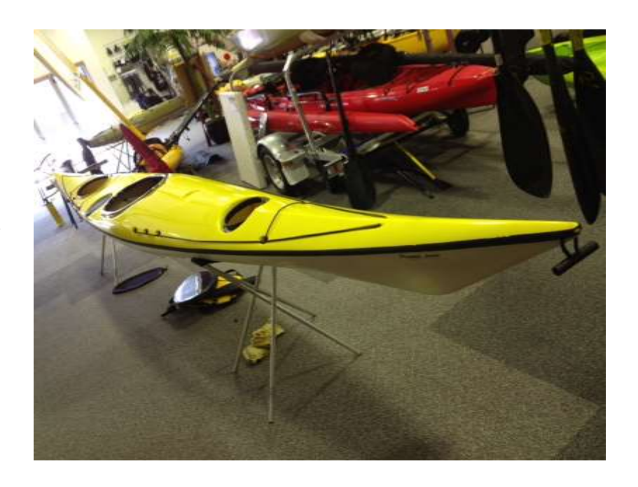
Mirage 580: fibreglass construction. Used, but still good for plenty of trips. Includes PFD and trolley. $1799 - view at Wetspot