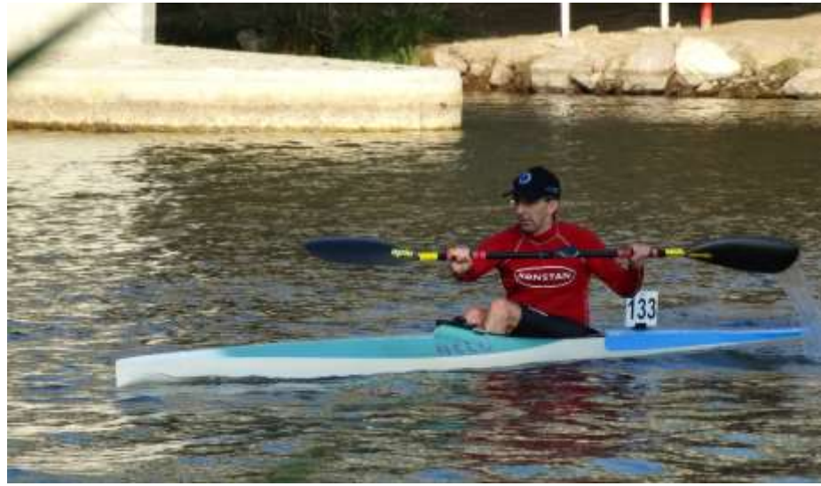
Thanks Nick Grey for compiling the time trial point score over the last 12 months.