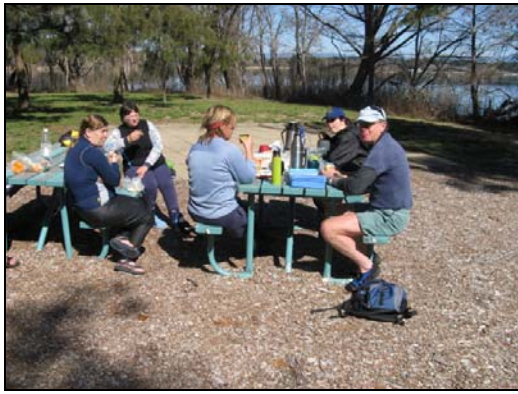
Lunch on Springbank Island