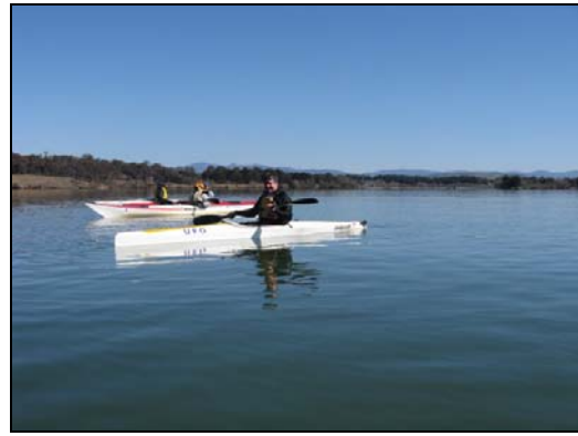
A beautiful day on Lake Burley Griffin